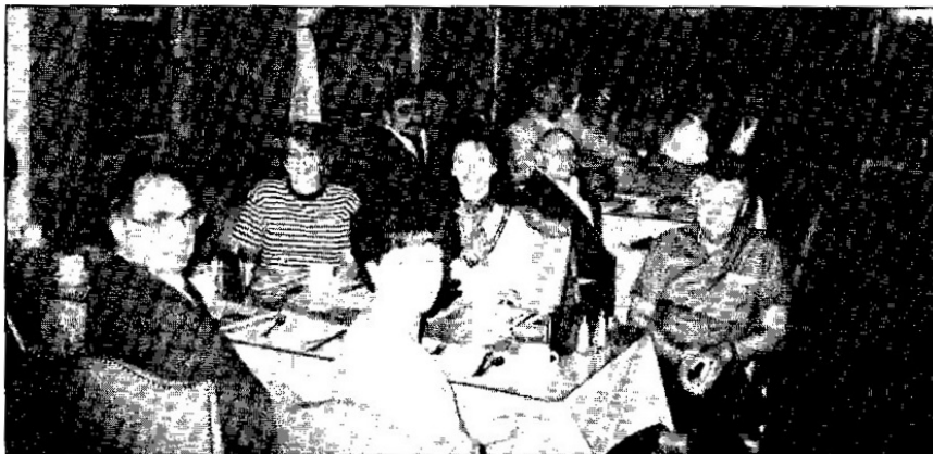
Woodbury Breakfast Rotary Club's members at an early meeting

After the fifth meeting at the Homesteader Restaurant in Woodbury, the provisional club had 29 paid members, which is two