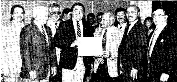
Members of Pinelands Rotary receiving a certificate of recognition for South Jersey Rotary Golf donation to The Children's Hospital for Southern New Jersey. Pinelands has sponsored South Jersey Rotary Golf outings since 1985.