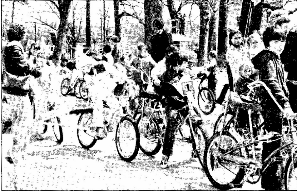
A bicycle safety course sponsored by Absecon Rotary in cooperation with the Absecon Police Department.

Sponsored by the Rotary Club of Mays Landing, the Rotary Club of Absecon was chartered on Tuesday, Nov. 22, 1977. Absecon was the first breakfast club in District 764.