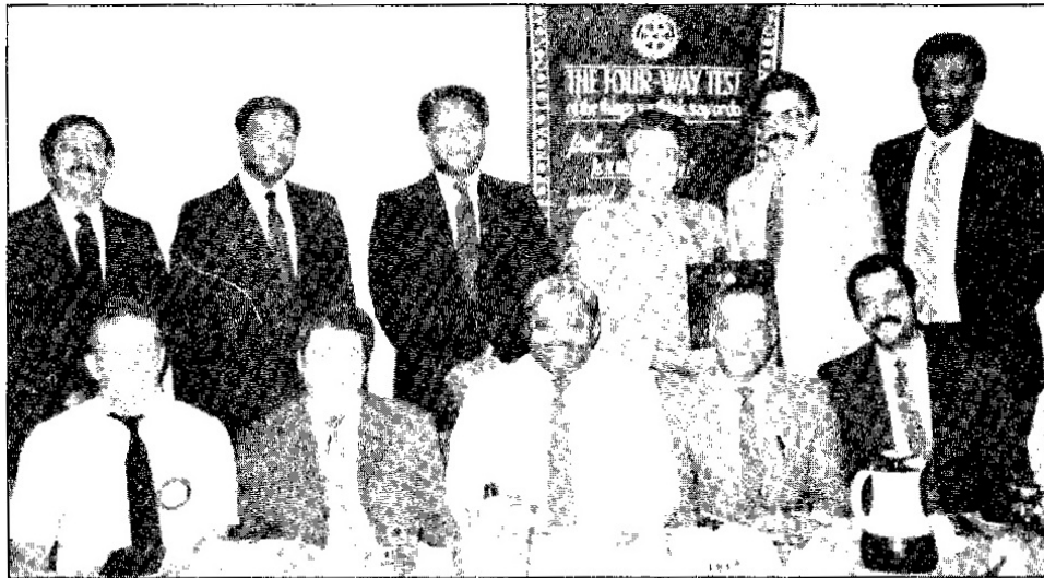
Winslow Township Rotarians pose for a group shot.

During the 1987 District 764 conference at the Concord Resort, the Winslow Township Rotary was recognized as the first district club to maintain a 100 percent attendance record. That was appropriate recognition for a club which has proved conclusively it has a small membership but a big heart.