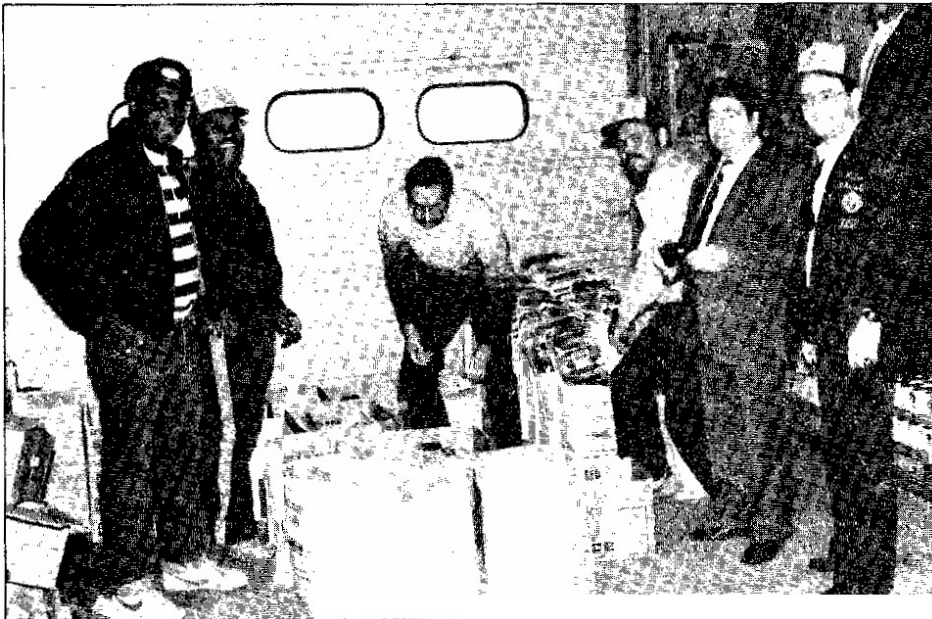
Winslow Township Rotarians prepare and deliver food baskets for the needy at Christmas time.

Among its fund-raisers have been an annual dinner dance and a flea market. It has, given support to the local volunteer ambulance association.