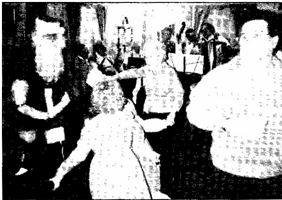
Deptford Rotarians at Cedars Rest Home Christmas Party.

Also at Christmas, the club raises as much as $16,000 at a local K-Mart store through an angel tree to provide gifts for underprivileged youngsters in the Gloucester County area.