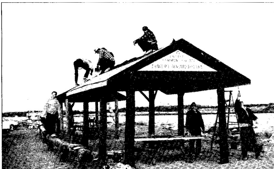
The Lower Township club spent time building pavilions near the Cape May-Lewes Ferry for the community to enjoy.