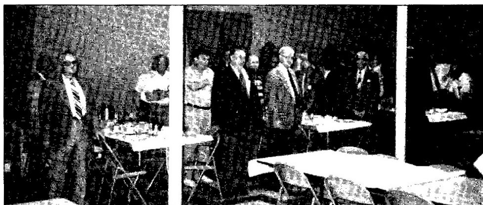
Elmer Rotarians prepare to salute the flag before a club meeting in 1989.

Perhaps Elmer's most challenging and most visible project among many has been its long-standing commitment to the youngsters of the Elmer area through Little League baseball. During his tenure as president in