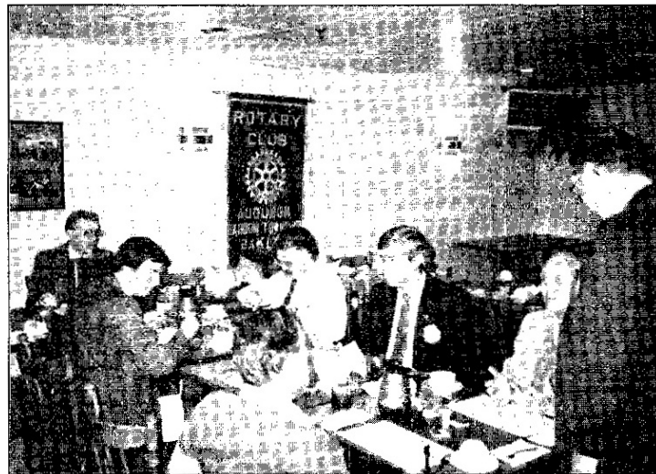
Audubon-Haddon Twp.-Oaklyn Rotarians at a club meeting

Original meetings were conducted in the P.O. of A. Hall in Audubon. Through the years, Audubon-Haddon Township-Oaklyn has met in the Honeydew in Oaklyn, the Parkview in Collingswood, the Collmont Diner in Westmont, and at its current location at Compton's Restaurant on Cuthbert Boulevard in Westmont.