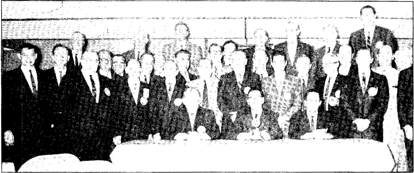
Mt. Ephraim Rotarians pose for a group shot in 1968.