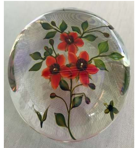
Flowers so real looking people mistakenly thought that he had found a way to encase actual flowers in glass