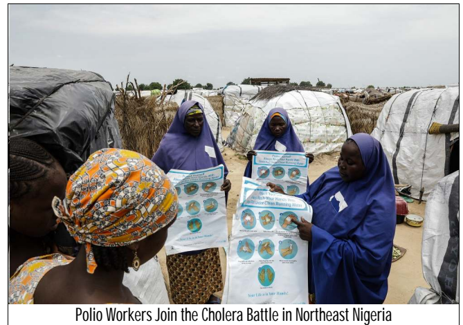
Polio Workers Join the Cholera Battle in Northeast Nigeria